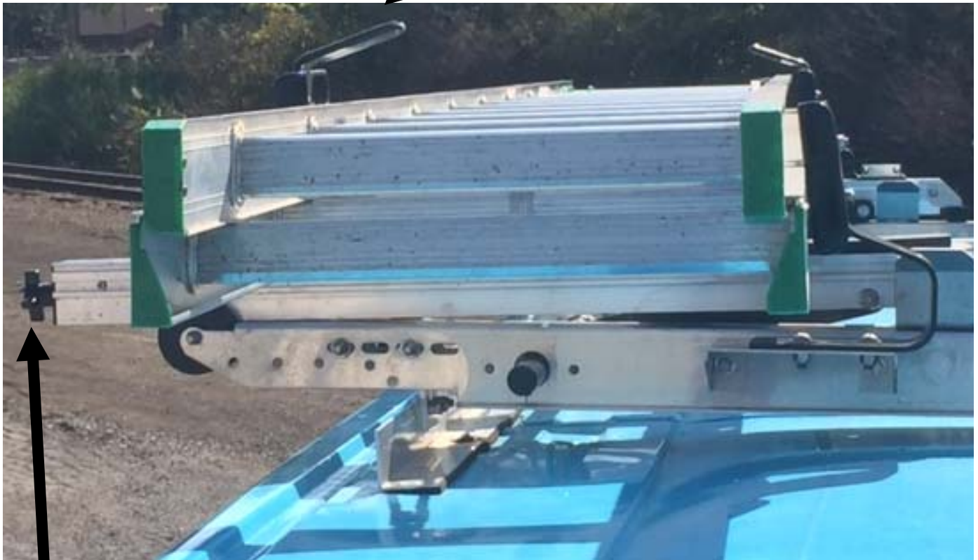
FRONT OF VEHICLE

TURN KNOB TO ADJUST TO YOUR LADDER. DO NOT OVER TIGHTEN! CLAMP PAD SHOULD JUST TOUCH THE LADDER.