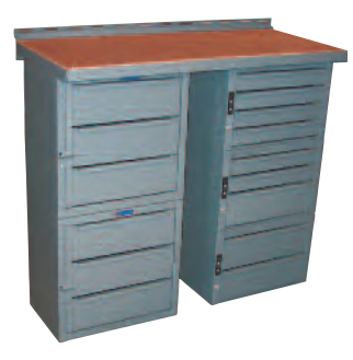
MD708T Combines a masonite work top with a mix of small and medium drawer units. Includes (2) #8, #9, #19, #919, #54. Measures 42"W, 38"H, 14/18"D.

MD704T Storage Unit Features lockable door kit cover, divided shelf storage, four small and two medium drawers. Measures 42"W, 60"H, 14"D.