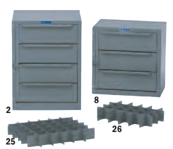
Drawer Units - Locking Hinge & Hasp #2 measures 18"W x 24"H x 18"L #8 measures 18"W x 18"H x 12"L