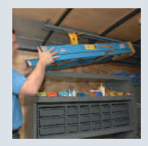
2 Walk the ladder back as the front clamp bracket glides on the track.