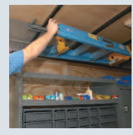
Simply press ladder inward to release rear ladder rung from the rear clamp bracket.