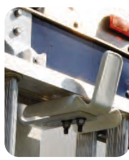
Plastisol ladder clamps protect fiberglass ladders

Note: The length of ladder the SDL2T can accommodate is determined by the length of the trailer.