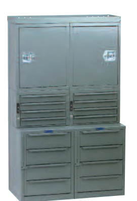
MD702T Drawer Cabinet Module Combines top tray, two locking cabinets, eight small and eight large drawers. Measures 36" W, 60" H, 12"/18" D.

MD604T Drawer/Cabinet Module Features four lockable cabinets and eight shallow drawers. Cabinets feature an open side and combine to form a 36" wide compartment.. Measures 36" W, 56" H, 12" D.