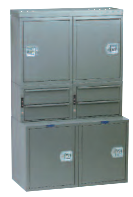
MD701T Drawer Cabinet Module Features four locking cabinets, top tray, and four medium drawers.