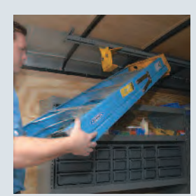
3 Remove front rung from the front clamp bracket and you're ready to go to the job site!

Store ladders inside the trailer and off the floor with the LK8 Ladder Keeper. The Ladder Keeper features plastic coated clamps to protect the ladder rungs, a gas spring that compresses ladder rungs for secure transportation and an extruded track that simplifies loading and unloading the ladder. The Ladder Keeper will accommodate up to an eight-foot ladder. Longer trailers can accommodate longer ladders with the option LKX extension that provides 4' of additional track. The Ladder Keeper requires roof bows in the trailer for installation.