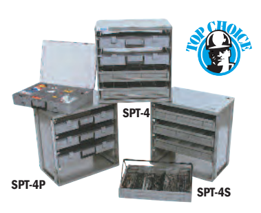
Tote Trays and Cases Measures 19-3/4"W x 20-1/8"H x 13-3/8"L.